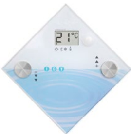
ICY Timer Thermostat

The basis of the system is the ICY1842IN Remote Set. This set consists of an ICY Gateway and a Timer Thermostat. The system communicates via a local wireless network generated by the ICY Gateway (ICY-Net). This makes it easy to expand the system with other ICY equipment once this network is set up. An overview of the options is shown below.