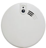
Smoke or heat detector

"Generates an alarm in the event of frost and power failure."