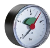
CV pressure sensor

"The meter readings of all your locations can be read immediately."