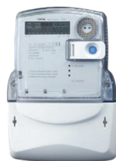
Energy meter reading

"Generates an alarm in the event of smoke or fire."